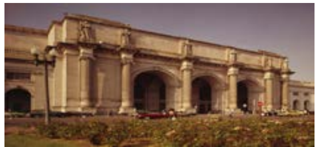
This photo highlights a view of Union Station from the southwest in 1974.

On the following page is a photo of the WMATA metro station tunnel construction on the west side of Union Station taken in December 1973.