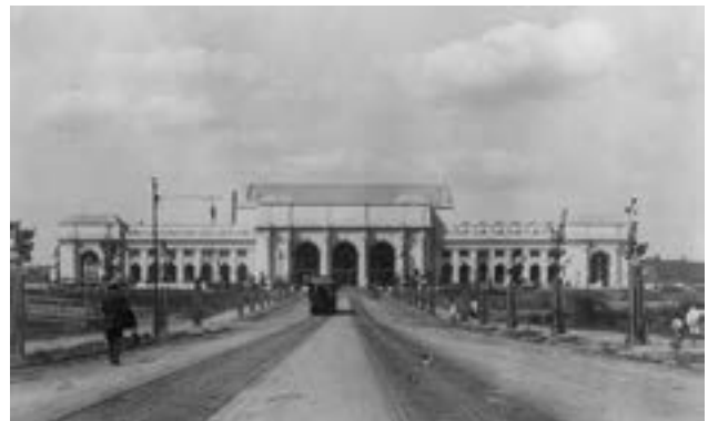
In this photo, taken c. 1910, you can see the trolley tracks that once led to Union Station.

Lastly, USRC continues to expand our historic photograph collection with credit to the Library of Congress, George Washington University Special Collections Research Center, and the Historical Society of Washington, DC USRC has also expanded the historic newspaper articles collection with the assistance of the DC Public Library.