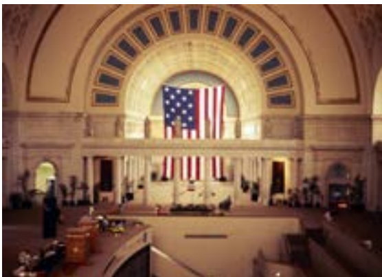
Taken c. 1976, this photo shows the National Visitor Center in the Main Hall in the direction of the West Hall with an American flag prominently displayed.

Since 2014, USRC has used a system of organization for records, drawings, photographs, historic documents, and digital files that adheres to best practices. In accordance with the collection development policy, USRC collects, preserves, and provides access to available records related to the history of the corporation and Union Station, supporting the core mission to preserve and restore the station's historic and architectural significance. The policy includes a scope of relevant topics that document the physical and cultural history of Union Station, as well as guidelines for expenses and usage of records.