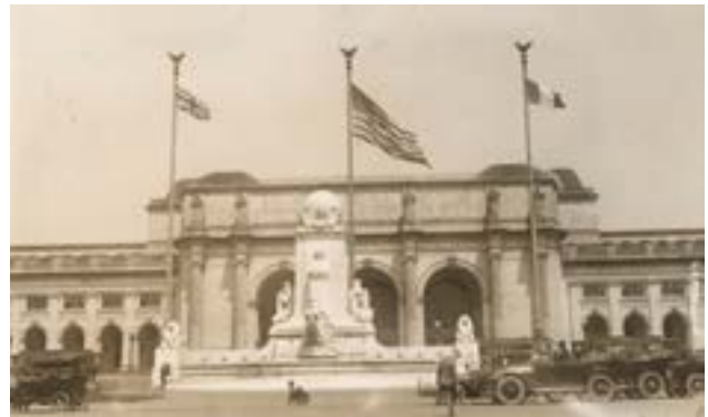
This photo, taken in 1917, shows the British, American, and French flags in honor of the British Commission, which represented all the allies in WWI.

In FY 2017, USRC received the National Trust for Historic Preservation's Cynthia Woods Mitchell Fund for Historic Interiors Grant, a grant that assists in the preservation, restoration, and interpretation of historic interiors. Through this funding, USRC partnered with Building Conservation Associates (BCA) to complete a historic interior lighting study of Union Station, which was published in March 2018. The study documents the history of the station's natural and artificial lighting in the Main Hall, West Hall, East Hall, Presidential Suite, and Retail Concourse, providing useful information for future preservation and station development projects. BCA presented the study at the Construction History Society of America's biennial meeting in College Park, MD in May 2018 and led several study-focused tours at the station with USRC's assistance.