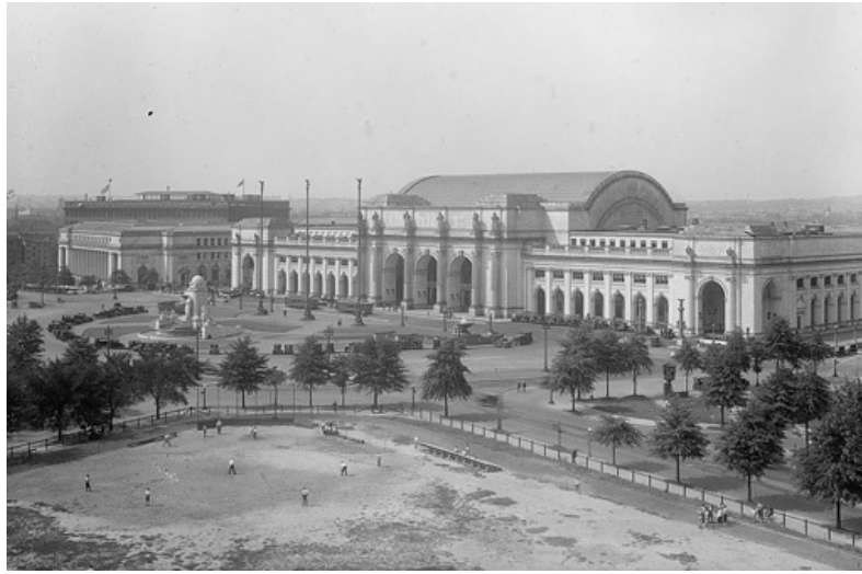
A baseball game in the foreground of Union Station circa 1925

To subscribe to USRC's quarterly newsletter, email usrc@usrcdc.com .