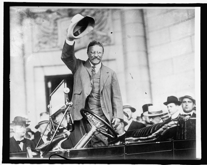
President Theodore Roosevelt outside Union Station in May 1914