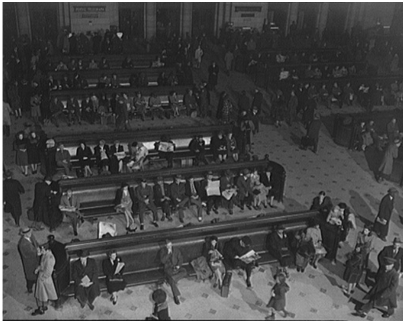
People waiting in the Main Hall in November 1942

To subscribe to USRC's quarterly newsletter, email usrc@usrcdc.com .