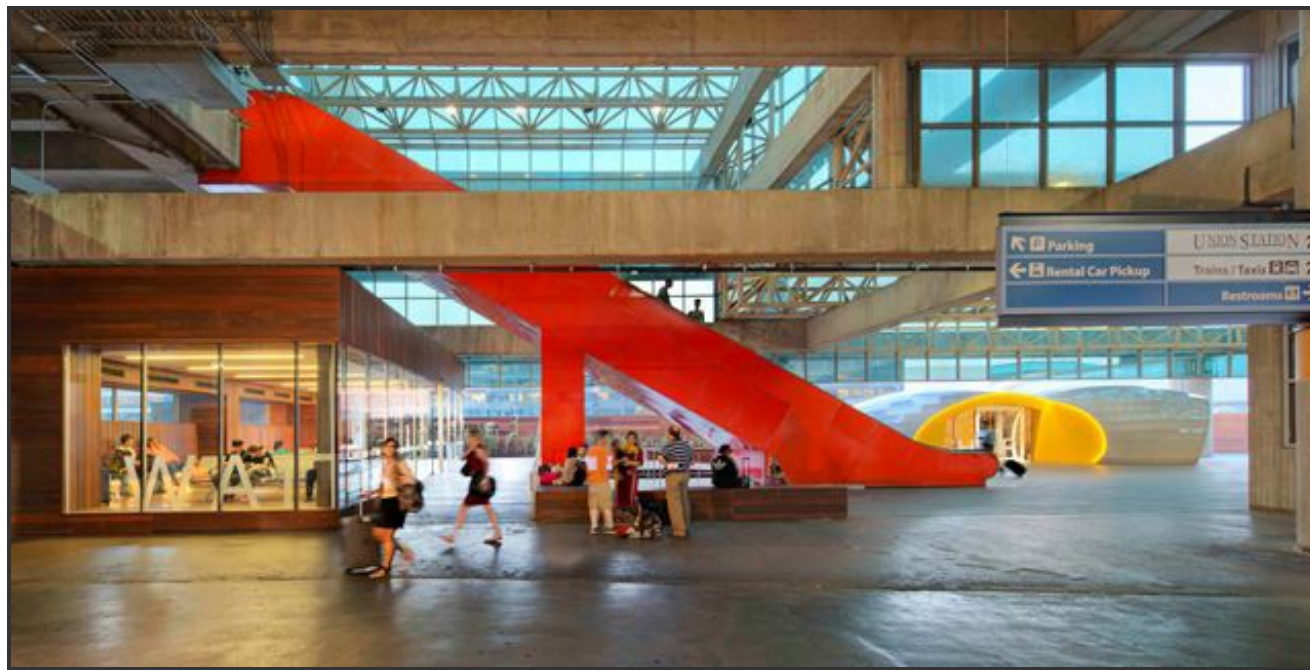
Union Station Bus Terminal.