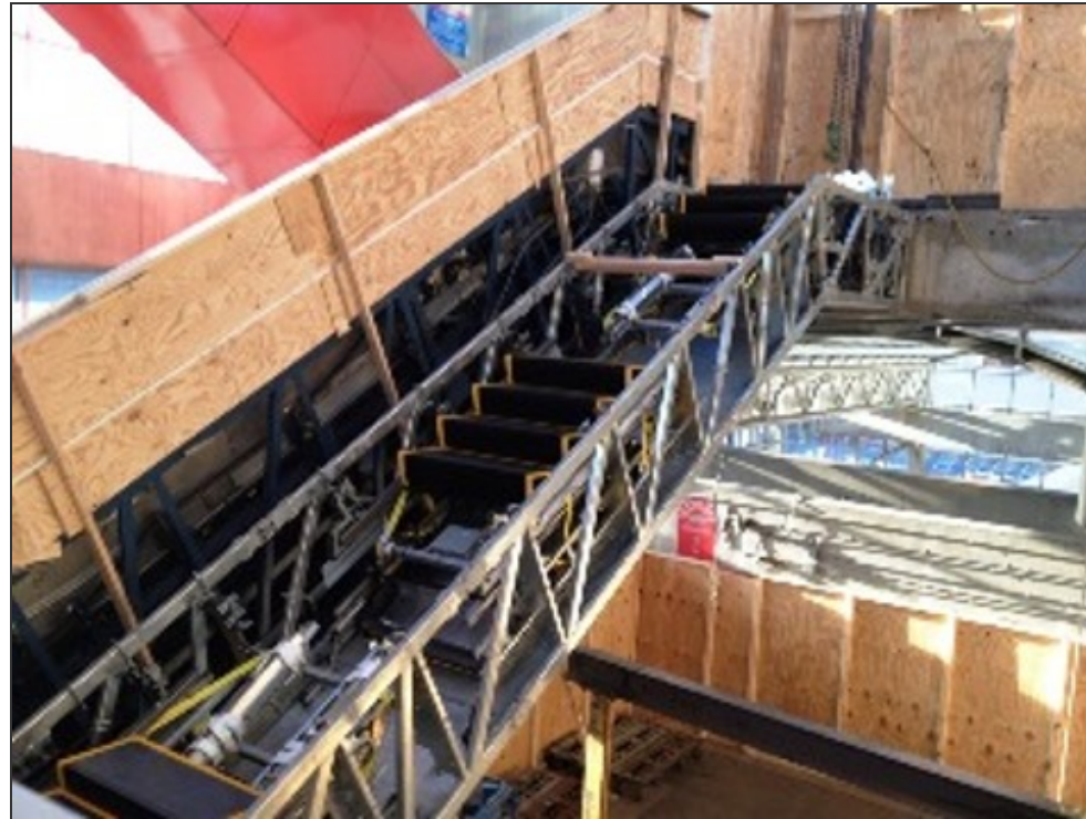
The first new garage escalator being installed between levels 2 and 3.

The first three escalators have been removed and new ones installed. Once these escalators are put into service in October, the three adjacent escalators will be closed and removed, with the new escalators operating in the “up” direction. The process will be repeated at the lower levels until all the escalators are replaced sometime in mid-2015.