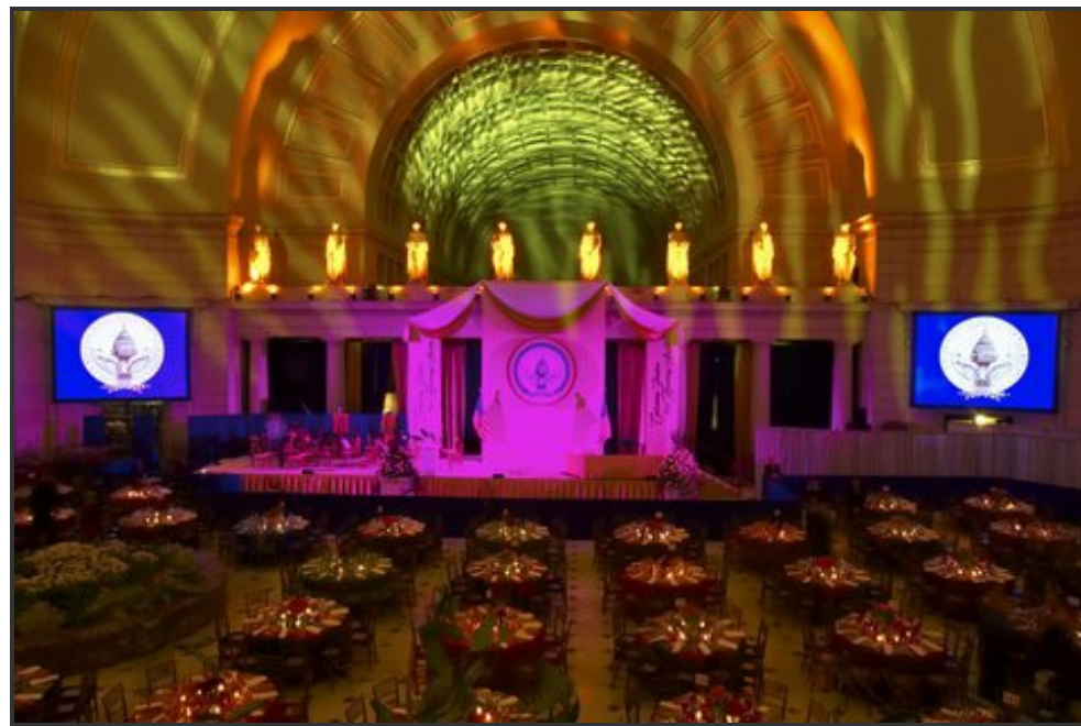
Inaugural Candlelight Dinner, January 19, 2005.