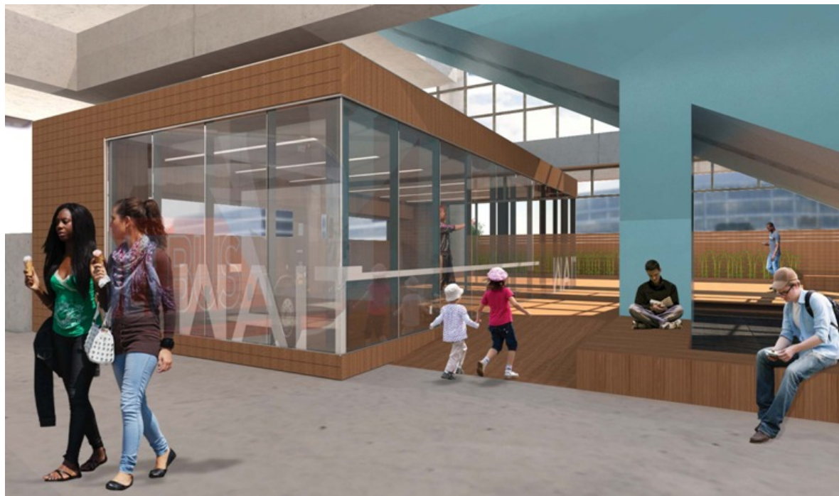
Rendering of proposed Retail/Information Pavilion. Image courtesy of Studio 27 Architecture