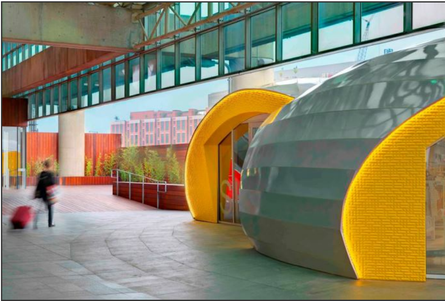
Information and Retail Pavilion in the Union Station Inter-city Bus Terminal.