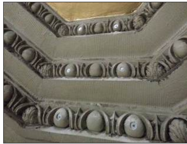
New fasteners installed from the front side of the ceiling will be tied to the back ceiling structure with wire ties.