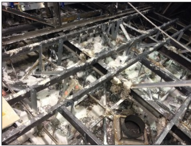
New steel reinforcing installed on the back of the Main Hall ceiling adheres the old plaster with the new plaster wadding.