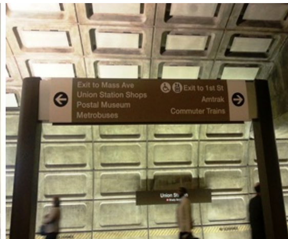
Proposed Main Hall and Passenger Concourse Signage.