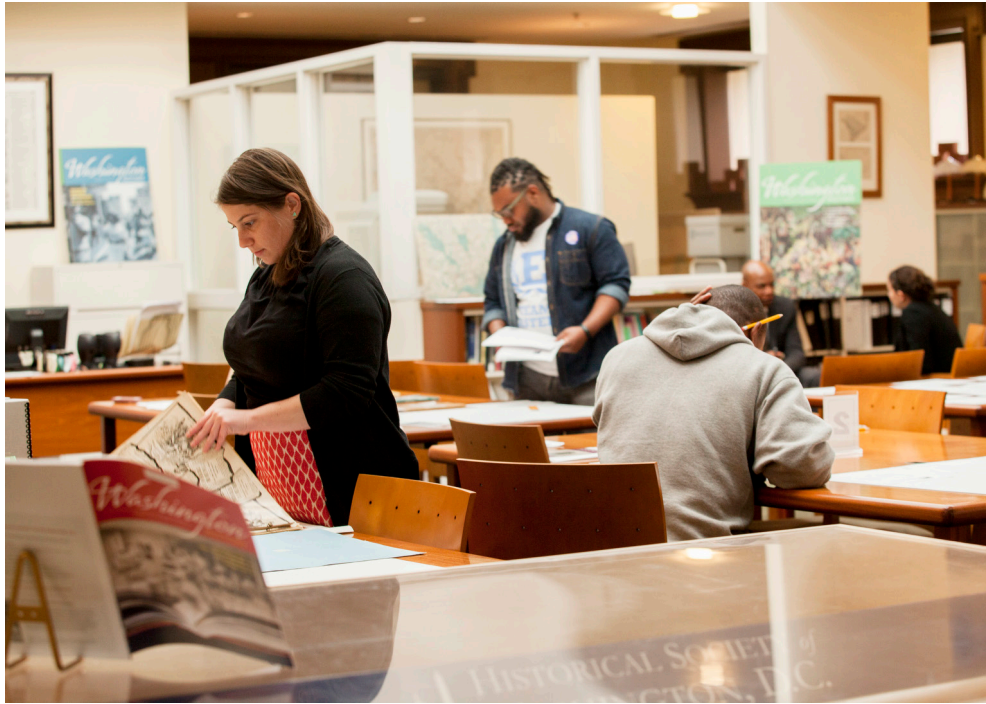
Professional development pilot program for D.C. history teachers