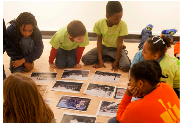
Two Rivers Public Charter School, 3rd Grade Historians

The Bloedorn Foundation generously supported FY16 educational school visits. The Association of the Oldest Inhabitants of D.C. celebrated its 150th anniversary with a $25,000 gift to the Historical Society for developing 3rd and 12th grade initiatives, including portable “history cart” prototypes.