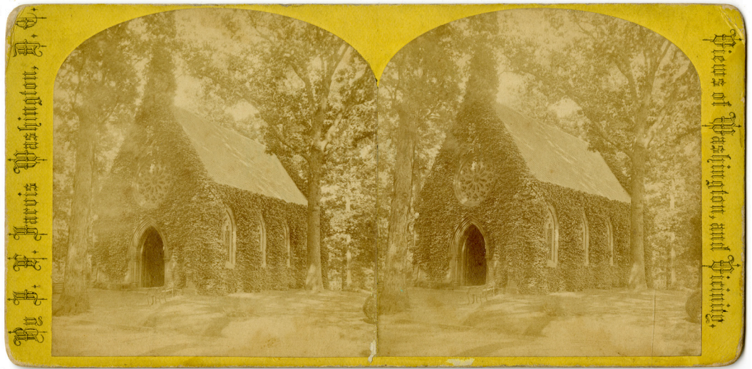
Stereograph of Oak Hill Cemetery from the Wayne Hill Stereograph Collection, SP 0129

The Kiplinger Research Library accessioned more than 40 collections and donations, including manuscripts, maps, business records, and photographs from individuals as well as organizations including the Washington Home & Community Hospices and The Washington Post.