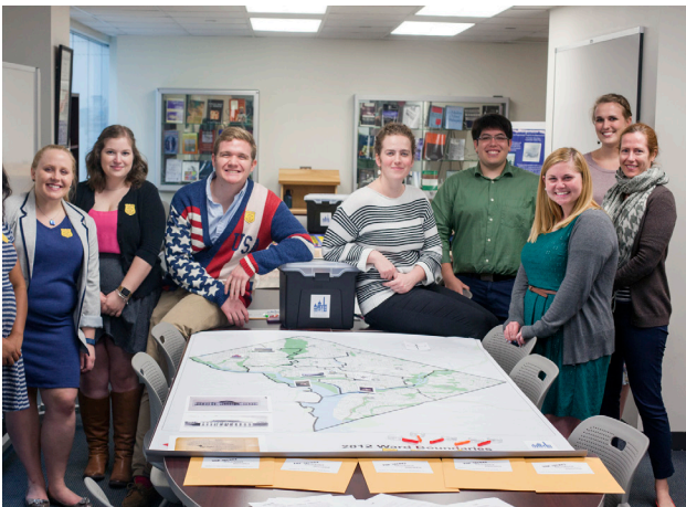
American University Public History student interns