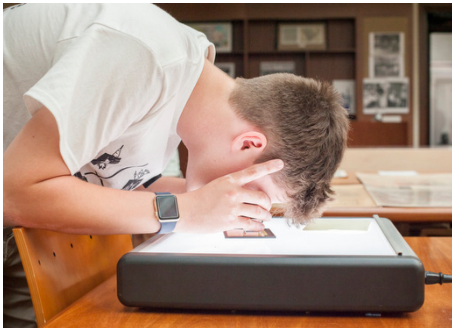
Discover D.C. incoming freshmen orientation program

Student groups explored history, culture, politics, and the visual landscape of the city at the Kiplinger Research Library. Participating schools and programs include: American University, Bridge DC, Boston University, Capitol Hill Montessori at Logan, Cornerstone Schools, The George Washington University, Investigating Where We Live, SEED Public Charter School, THATSummer, Two Rivers Public Charter School