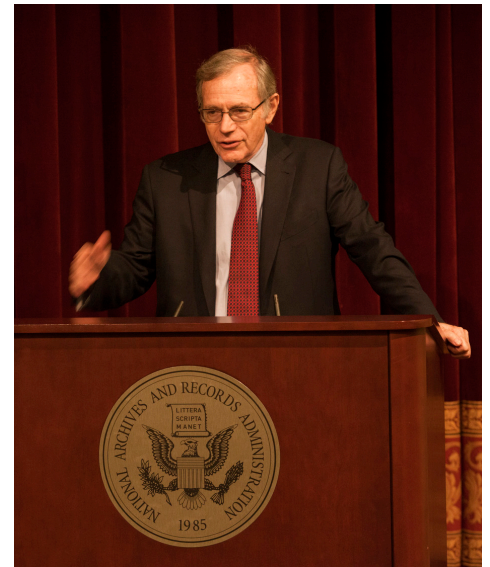
Eric Foner

Historically African American Leisure Destinations Around Washington, D.C.