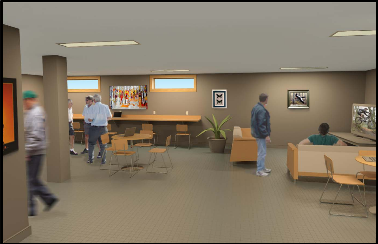
Proposed Interior Offsite Driver Facility