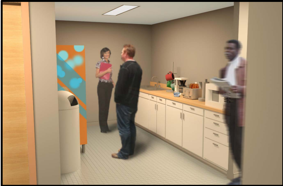
Proposed Vending and Snack Area