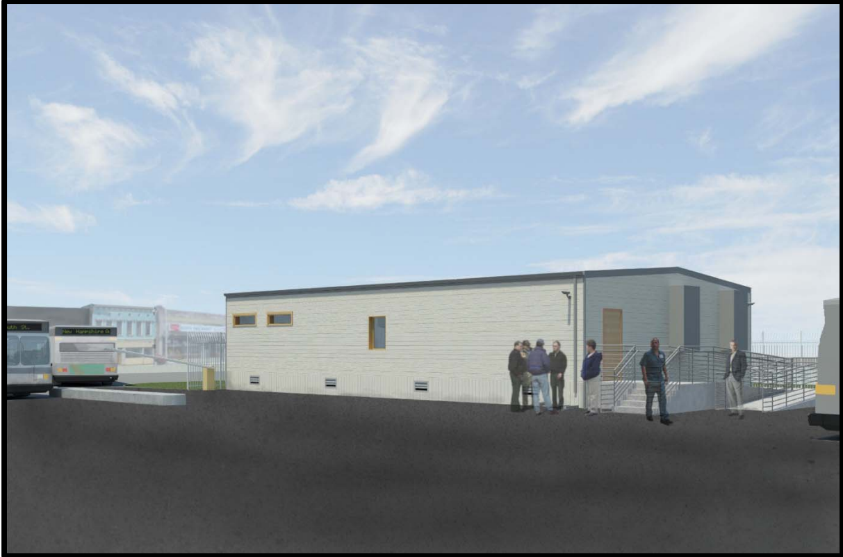
Proposed Exterior Offsite Driver Facility